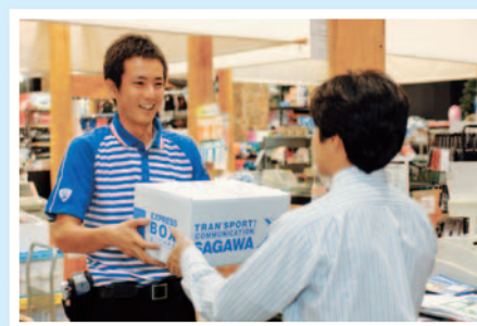
A smile is very important for work.

These work experience learning programs inspired many students to enter the company as sales drivers after they graduated from school and they are now working hard. This makes the employees who serve as instructors on site rethink work and saying, 'I remember the time when I entered the company, and at the same time I feel a responsibility for the future of young people.'