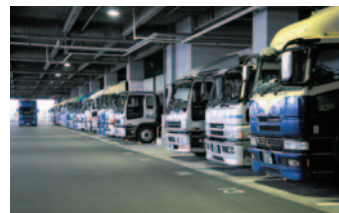
Parcels collected from around the country are distributed to each destination at our hub centers.

‘Physical distribution’, which delivers parcels to a requested place at a requested time, is a common practice in modern society, and this is important as society develops and changes. To practice such a physical distribution, we make various efforts in logistics and systems by constructing various processes and maintaining close networks both domestically and abroad while paying attention to the environment with efficient transport means and methods. For this reason, it can be called a social infrastructure. SG Holdings Group hopes that students experience these invisible roles and functions of ‘physical distribution’ through our work experience learning programs.